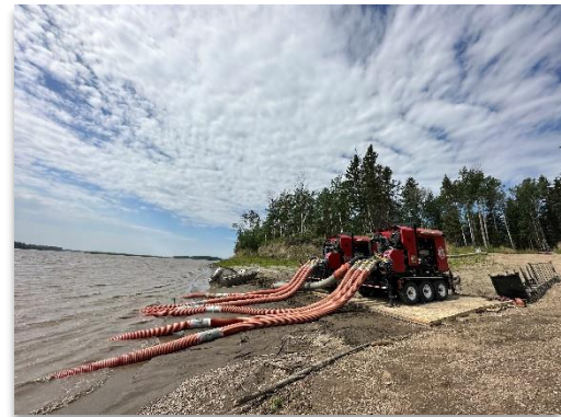
High-volume water pumps, C.Siddall

In Garden River, installation of the high-volume water system and additional sprinkler systems is complete. Today, crews will finish installing an additional water line along the eastern edge of the community. Structural fire fighters remain on standby, ready to respond if needed.